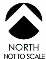
Exhibit "A.2" 121st Street Tract Overall Tract Exhibit

POC BRASS CAP FOUND NE CORNER SECTION 4, T-17-N R-14-E