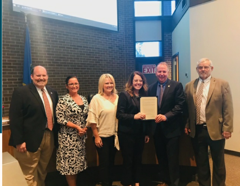
2019 Manufacturing Month Proclamation