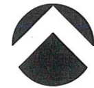
Exhibit "A.4" Creek 51 Business Park Utility Easement