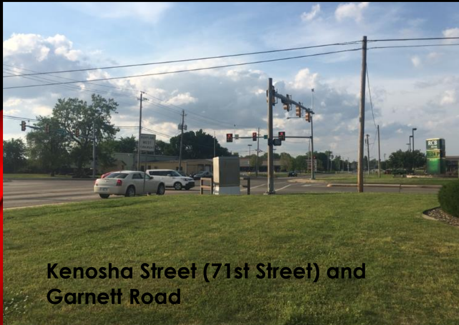
Kenosha Street (71 st Street) and Garnett Road

Jasper Street (131 st Street) and Garnett Road