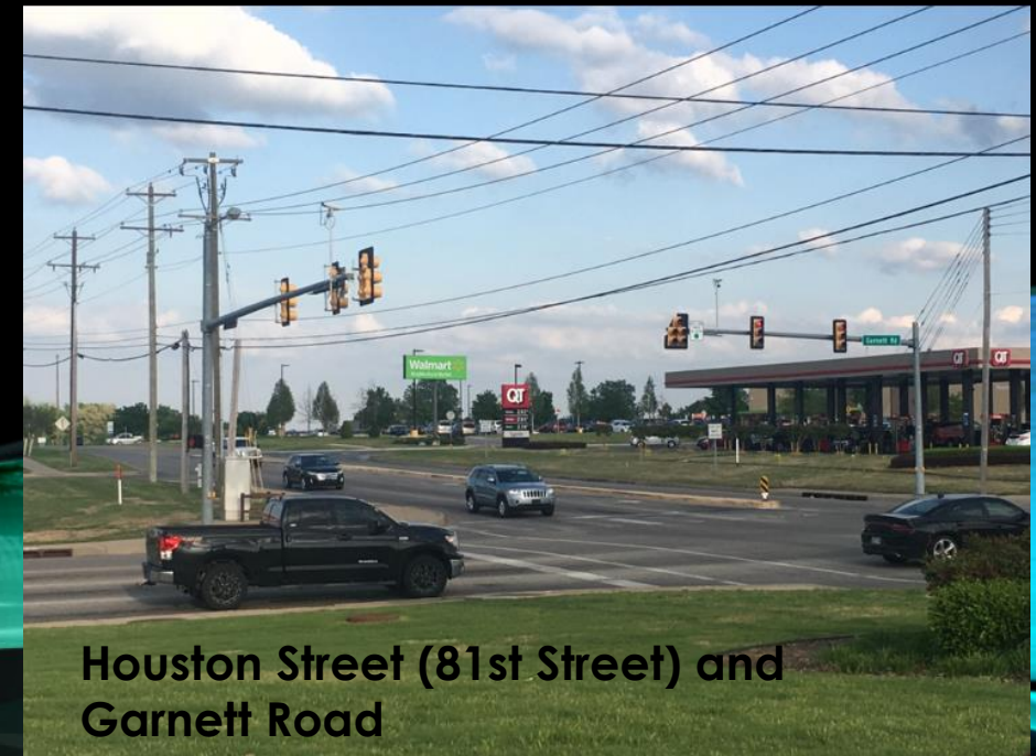
Houston Street (81 st Street) and Garnett Road