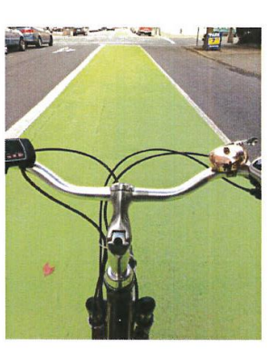
COLORED PAVEMENT WITHIN A BICYCLE LANE INCREASES THE VISIBILITY OF THE FACILITY, IDENTIFIES POTENTIAL AREAS OF CONFLICT, AND REINFORCES PRIORITY TO BICYCLISTS