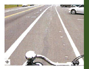
BACK IN PARKING ADJACENT TO BIKE LANES PR SAFER LANE OF TRAVEL AND REDUCES CONFLIC