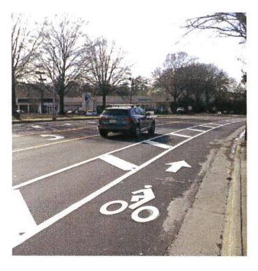
BUFFERED BIKE LANES PROVIDE GREATER SHY DISTANCE BETWEEN MOTOR VEHICLES AND BICYCLISTS