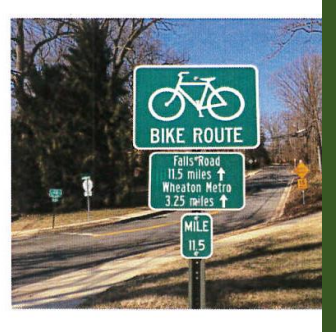
BIKE ROUTES ALERT DRIVERS THROUGH SIGNA