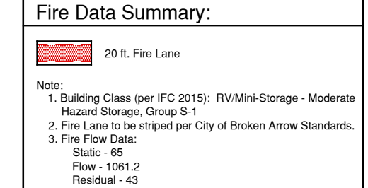
Exhibit A 51 Aspen Mini-Storage