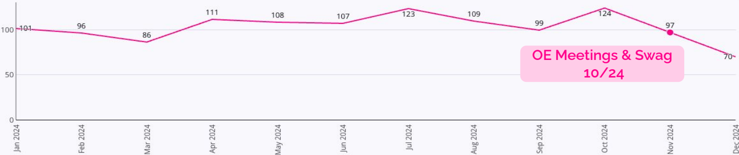
# Referrals Created