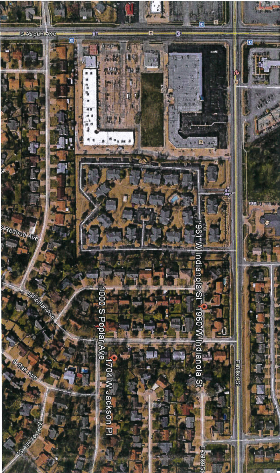
Work Order #26 - Work Locations