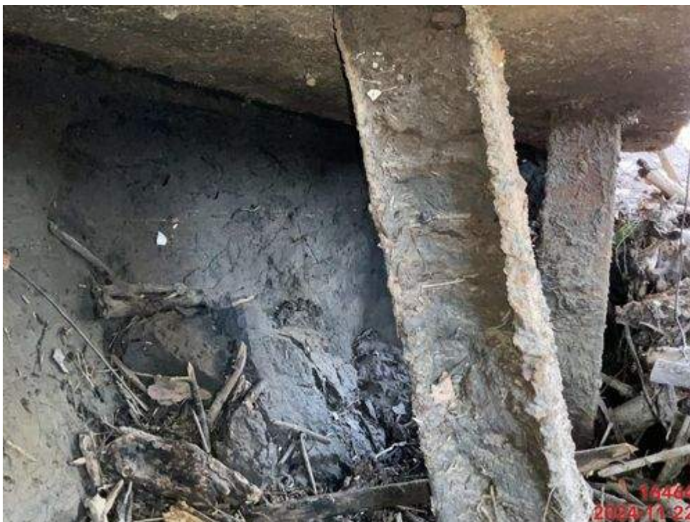
PHOTO 10: WEST ABUTMENT SCOUR - 22 FT. (LENGTH) X 6 FT. MAX (HEIGHT) X 6.5 FT. MAX (DEEP) EXPOSING 6 STEEL PILES