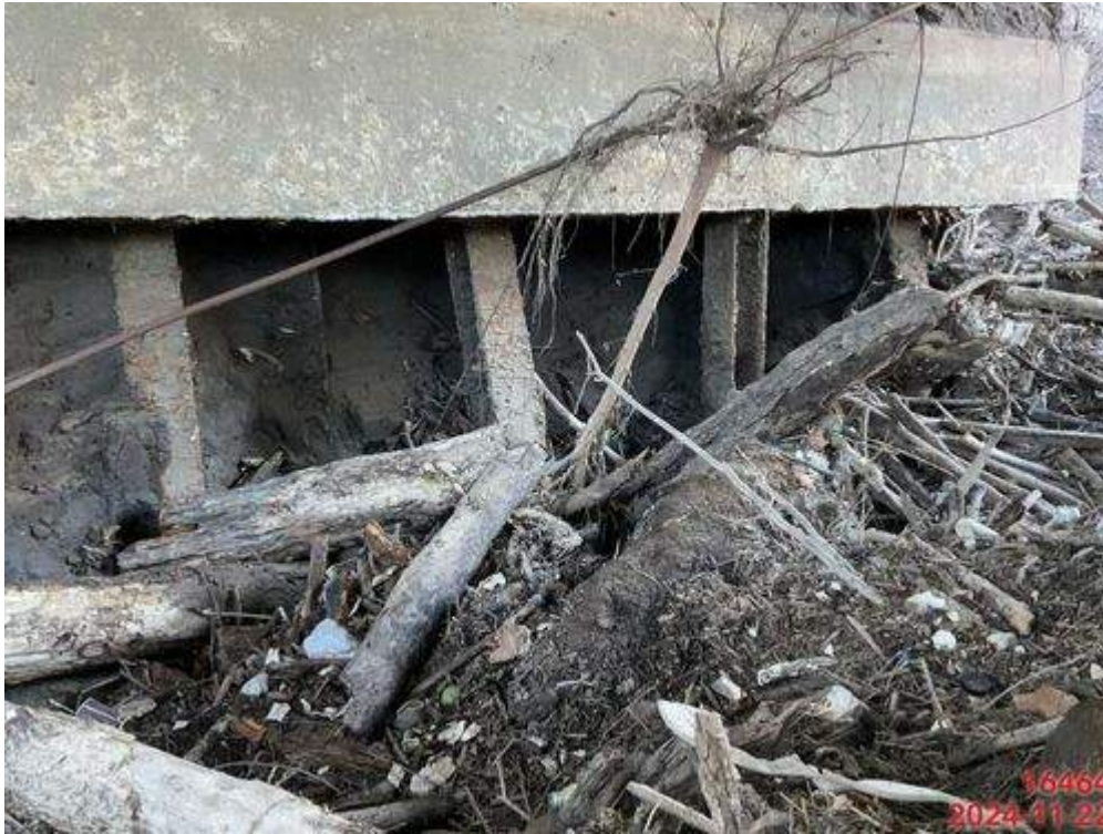
PHOTO 11: WEST ABUTMENT SCOUR - 22 FT. (LENGTH) X 6 FT. MAX (HEIGHT) X 6.5 FT. MAX (DEEP) EXPOSING 6 STEEL PILES

COUNTY: TULSA FACILITY CARRIED: NEW ORLEANS ST. FACILITY INTERSECTED: HAIKEY CREEK