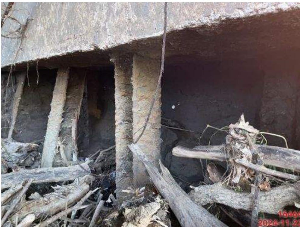
PHOTO 6: WEST ABUTMENT SCOUR - 22 FT. (LENGTH) X 6 FT. MAX (HEIGHT) X 6.5 FT. MAX (DEEP) EXPOSING 6 STEEL PILES