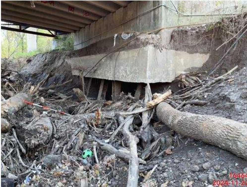
PHOTO 5: WEST ABUTMENT SCOUR - 22 FT. (LENGTH) X 6 FT. MAX (HEIGHT) X 6.5 FT. MAX (DEEP) EXPOSING 6 STEEL PILES

COUNTY: TULSA FACILITY CARRIED: NEW ORLEANS ST. FACILITY INTERSECTED: HAIKEY CREEK