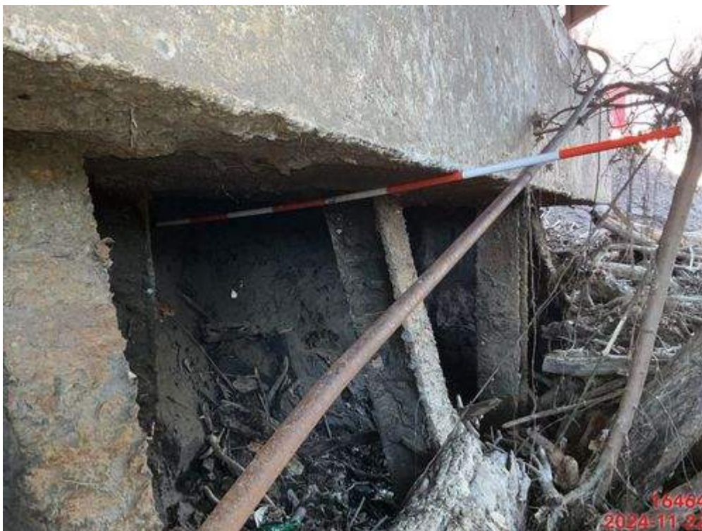
PHOTO 8: WEST ABUTMENT SCOUR - 22 FT. (LENGTH) X 6 FT. MAX (HEIGHT) X 6.5 FT. MAX (DEEP) EXPOSING 6 STEEL PILES