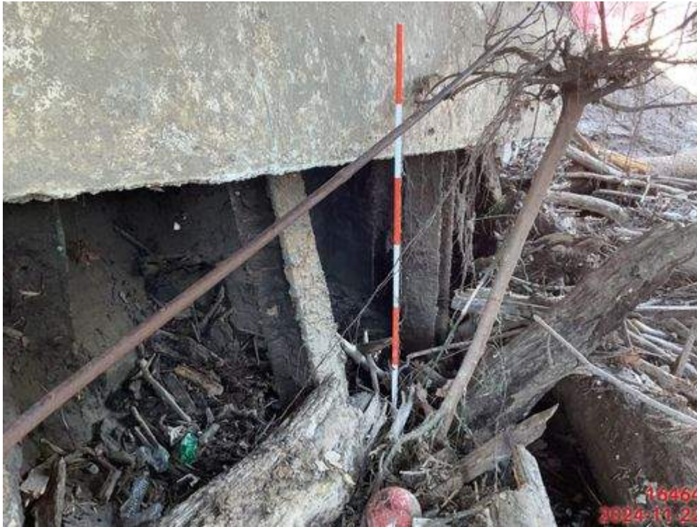
PHOTO 9: WEST ABUTMENT SCOUR - 22 FT. (LENGTH) X 6 FT. MAX (HEIGHT) X 6.5 FT. MAX (DEEP) EXPOSING 6 STEEL PILES

COUNTY: TULSA FACILITY CARRIED: NEW ORLEANS ST. FACILITY INTERSECTED: HAIKEY CREEK