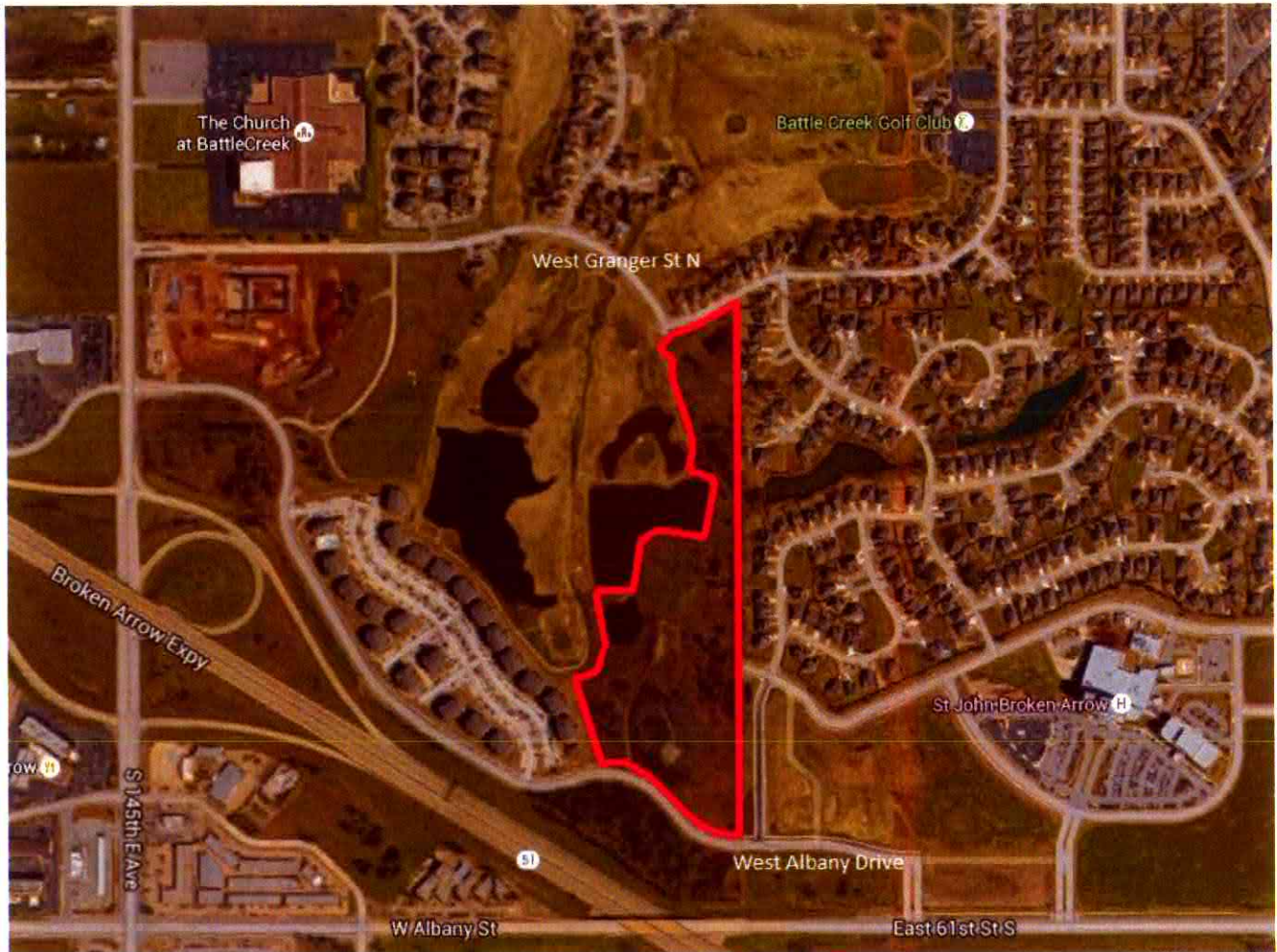
Exhibit A: Proximity Aerial

RECEIVED Nov. 9, 2015 BROKEN ARROW DEVELOPMENT SERVICES