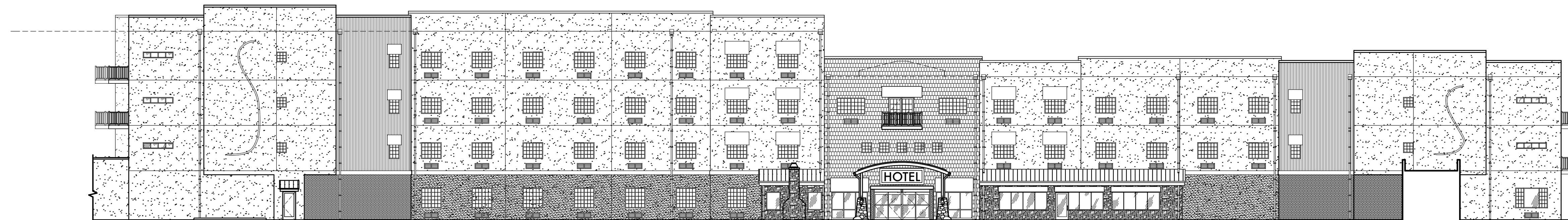
3 REAR (COURTYARD) ELEVATION SCALE: 1/16" = 1'-0"