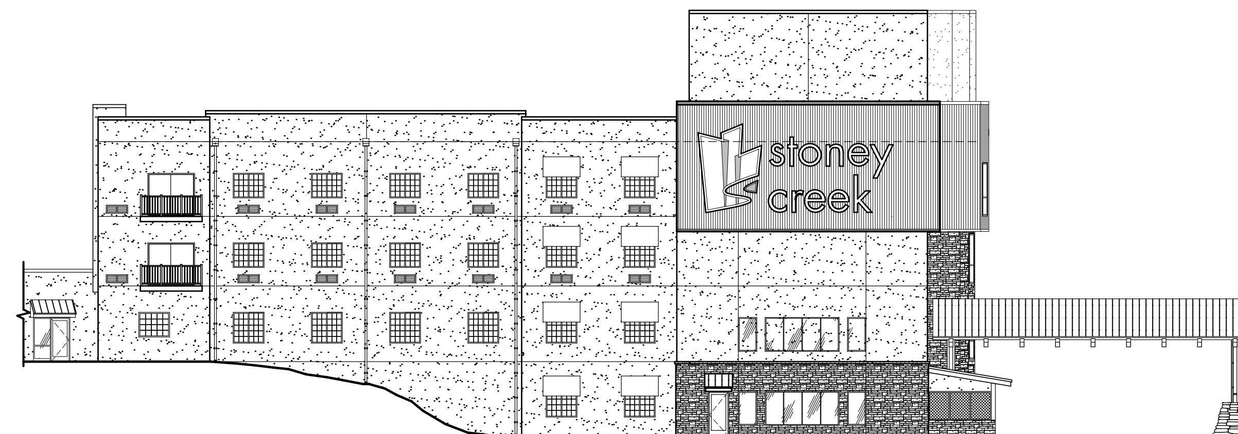
2 LEFT SIDE ELEVATION SCALE: 1/16" = 1'-0"