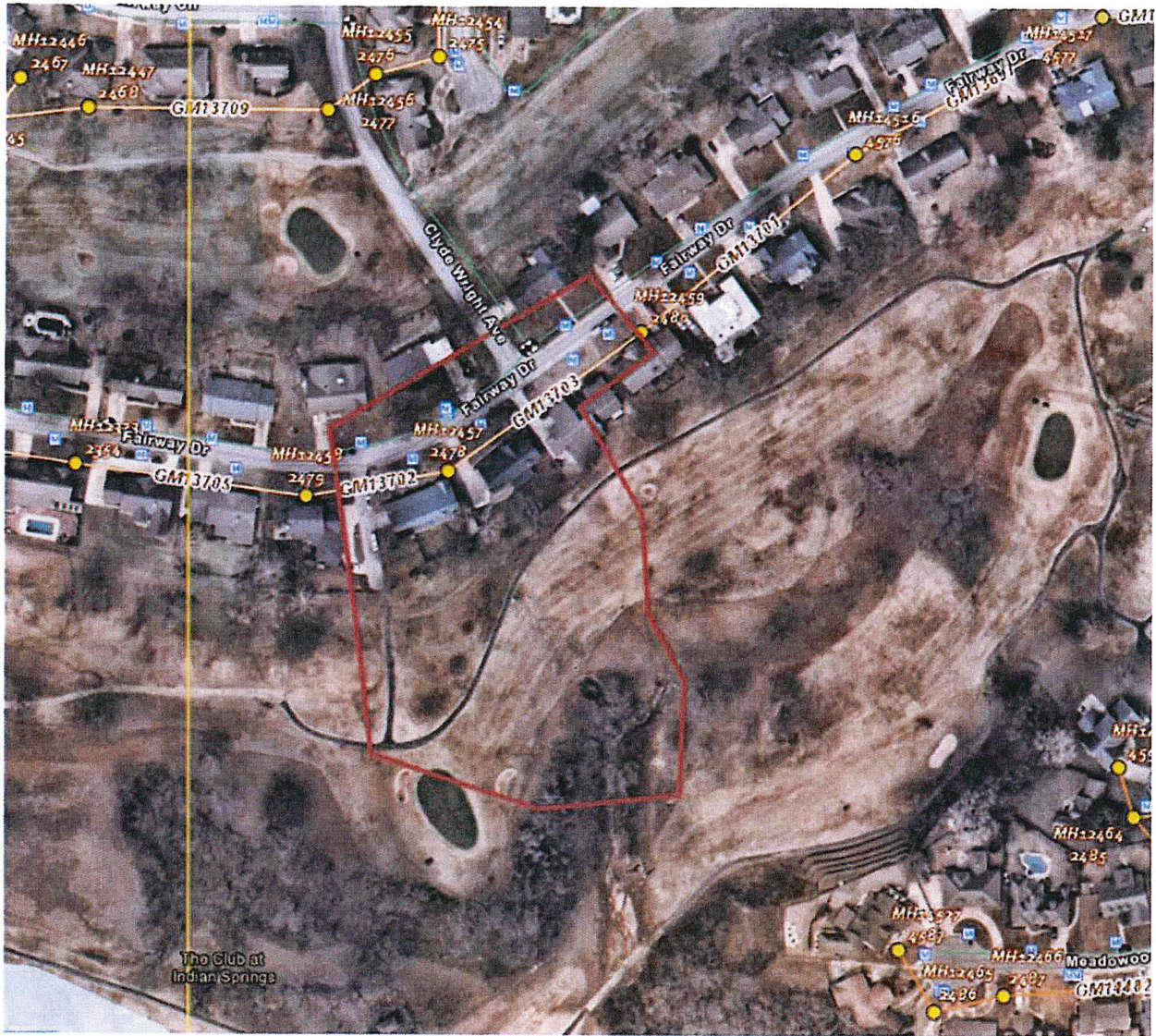
EXHIBIT 1: SURVEY LIMITS