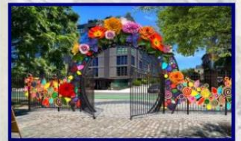
ICONIC ENTRY POINT FROM PARKING WITH SILO