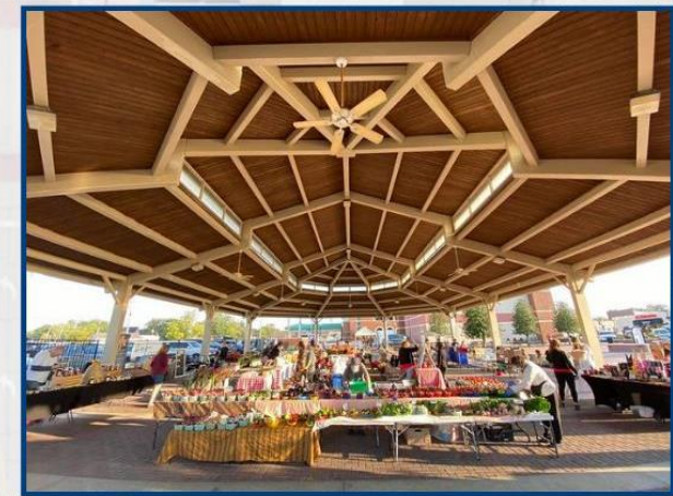
EXPANDED COVERED PAVILLION AND PERMANENT STAGE