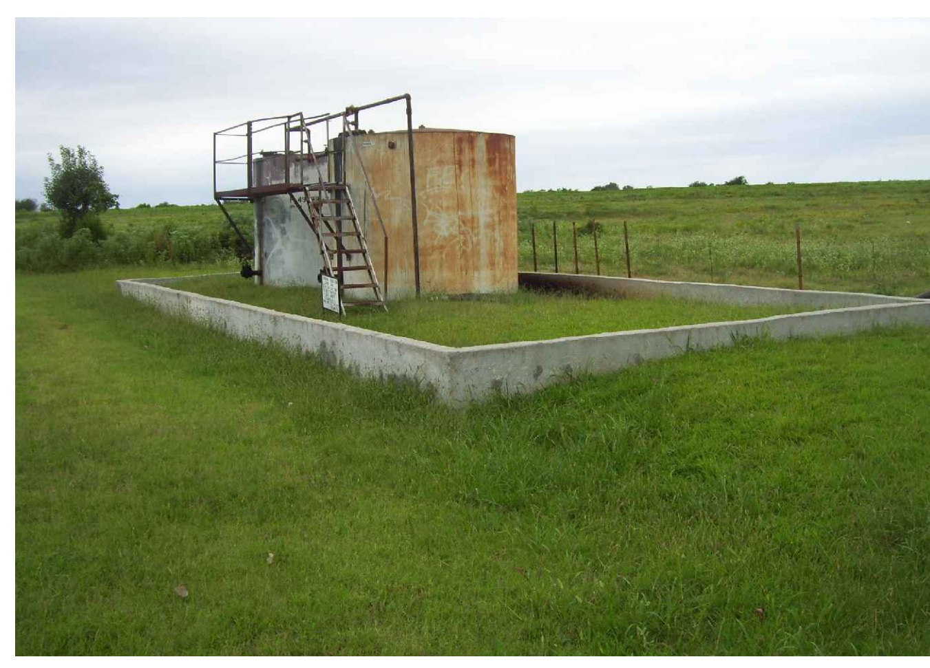
EXISTING OIL TANKS AND CONCRETE RETAINING WALL ALONG WASHINGTON STREET APPROXIMATELY 2,560' EAST OF S. 9th ST.

LEGEND X LOTS MAY NOT BE DEVELOPED UNTIL WELLS ARE CERTIFIED CLOSED PER OKLAHOMA CORPORATION COMMISSIONS RULES.