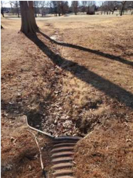
Figure 2 Outfall looking west