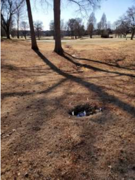
Figure 5 Sinkhole Picture