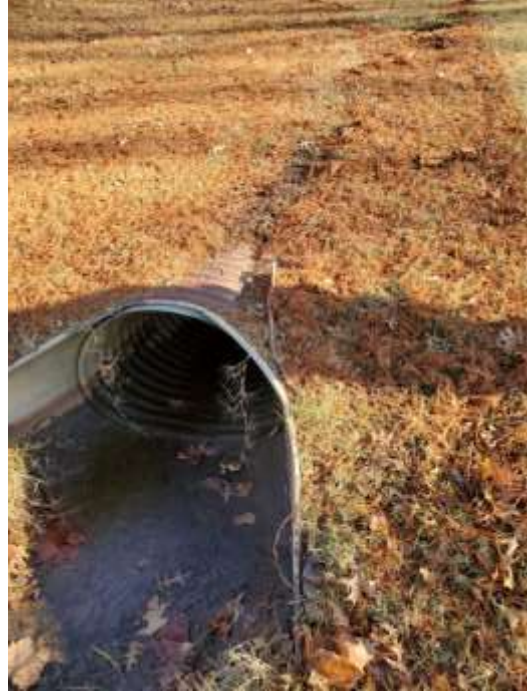
Figure 3 Outfall