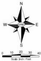
Scale: Inch / Feet