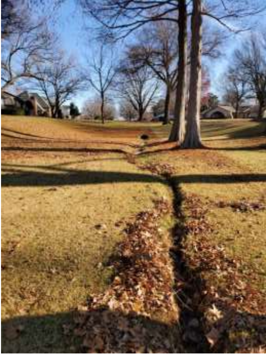
Figure 1 West Property line looking east