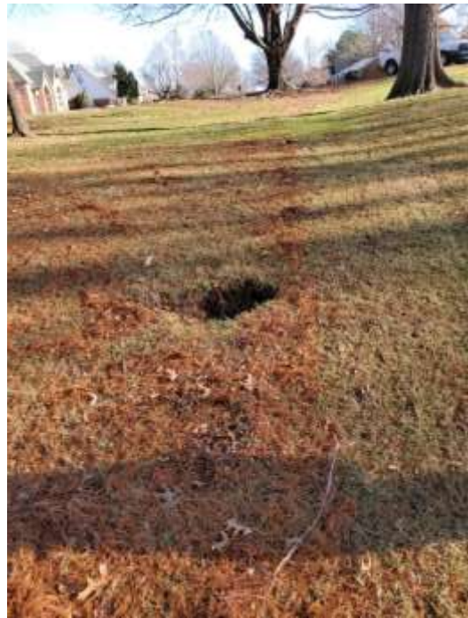
Figure 4 Sinkhole Picture