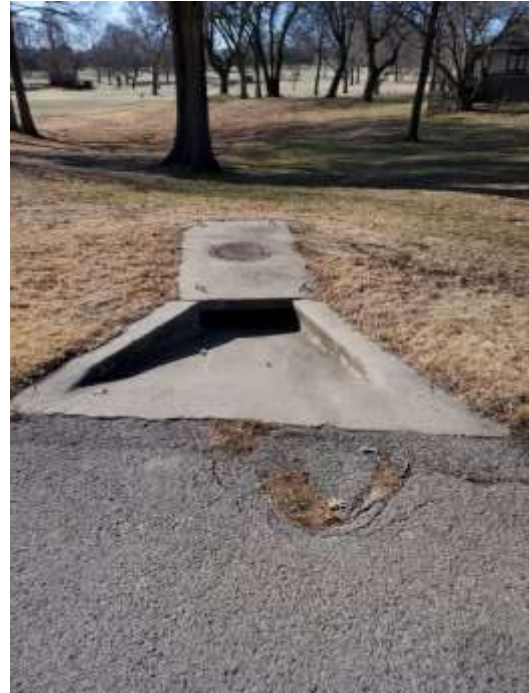
Figure 7 Cedar Ridge Rd Culvert - downstream