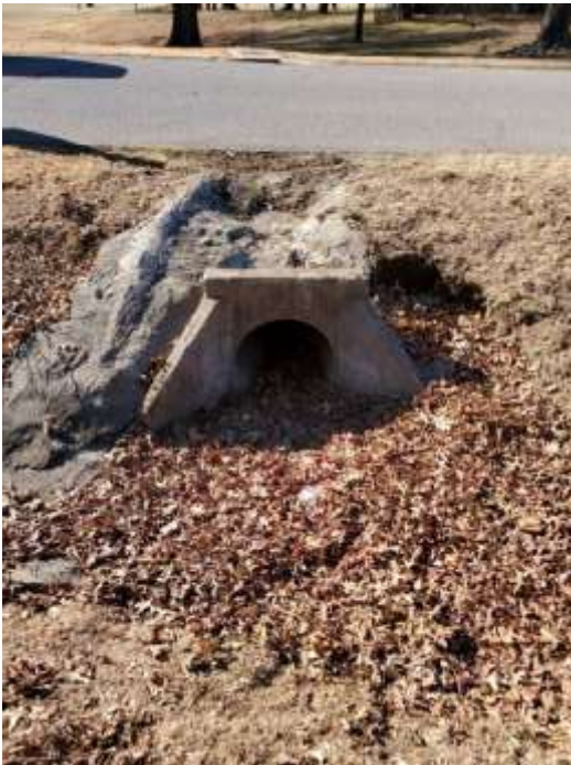
Figure 6 Cedar Ridge Rd culvert - upstream