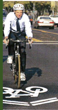
PAINTED SYMBOLS INDICATE BICYCLISTS' PRESENCE TO OTHER ROADWAY USERS