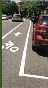
PAINTED WITH A BICYCLIST SYMBOL AND ARROW INDICATING DIRECTION OF TRAVEL

Both projects are in construction design and being managed by ODOT.