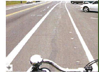
MOVING PARKING BACK IN PARKING ADJACENT TO BIKE LANES PROVIDES A SAFER LANE OF TRAVEL AND REDUCES CONFLICT