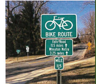
BIKE ROUTES ALERT DRIVERS THROUGH SIGNAGE ALONG THE ROUTE