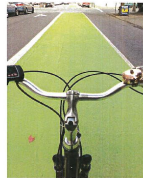
COLORFUL PAVEMENT WITHIN A BICYCLE LANE INCREASES THE VISIBILITY OF THE FACILITY, IDENTIFIES POTENTIAL AREAS OF CONFLICT, AND REINFORCES PRIORITY TO BICYCLISTS