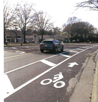
BUFFERED BIKE LANES PROVIDE GREATER SHY DISTANCE BETWEEN MOTOR VEHICLES AND BICYCLISTS