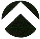
Exhibit "A.2" Buff Creek Blocks 1-7 Broken Arrow, Oklahoma Offsite Utility Easement For Storm Sewer Exhibit