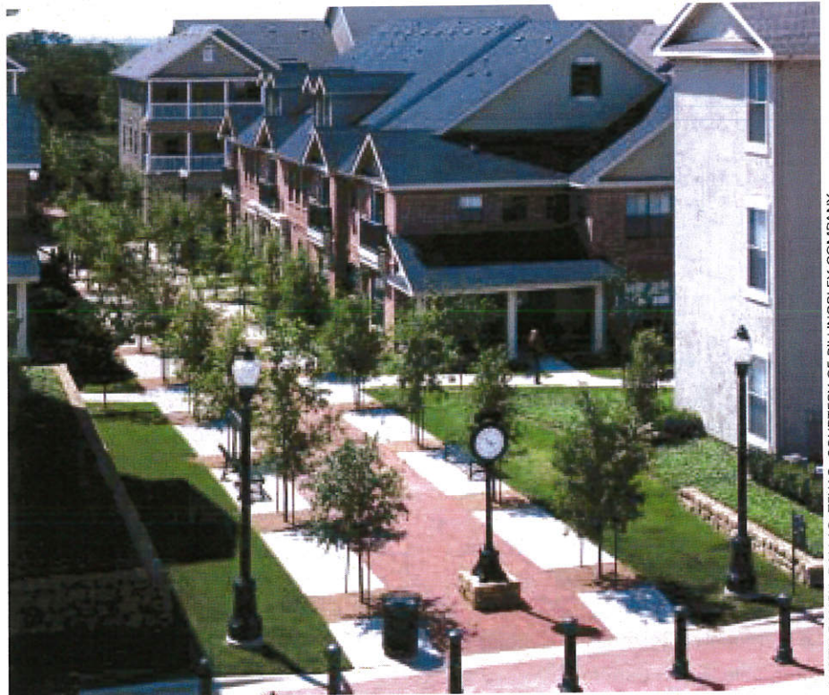
AUSTIN RANCH, DALLAS, TEXAS

Cities, counties, and states are in increasingly heated competition to attract companies to their areas. Good paying jobs, increased property and income taxes, and an improved quality of life for local residents are the expected pay-backs local governments hope to receive when a major employer decides to locate in their area. In the past, economic development officials would offer tax exemptions or abatements as incentives to convince companies to choose their location. Today, although taxes and the general business climate are still important, access to a large and diverse labor pool has become the most important factor in making corporate decisions on location. 20 And the number one problem facing the labor pool today is housing affordability. 21 Accessible jobs and affordable housing are, therefore, inextricably related. 22 A recent survey by the New York State Controller found that 86 percent of New York businesses surveyed cited housing costs as a serious deterrent to attracting firms to New York. Additional surveys in the suburbs of Chicago and Detroit have found similar results. 23 Multifamily housing typically, although not always, is more affordable than single-family housing and therefore represents a major economic development tool for cities, counties, and states.