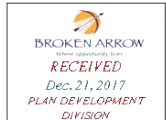
Exhibit “B”: Restore House/Customer Contract