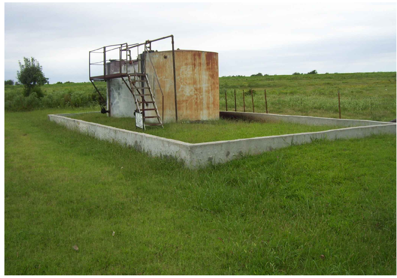
EXISTING OIL TANKS AND CONCRETE RETAINING WALL ALONG WASHINGTON STREET APPROXIMATELY 2,560' EAST OF S. 9th ST.